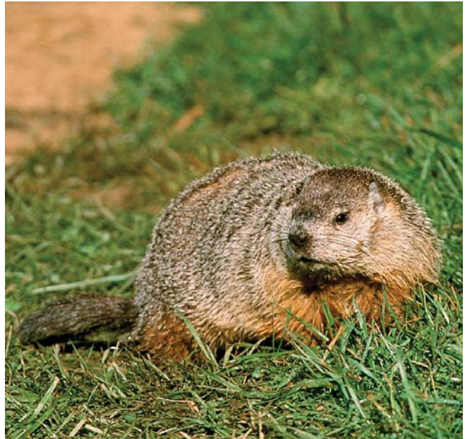
Top: A Groundhog's diet is mostly plant based. Bottom Left: A wet Groundhog next to the Nature Center in the early spring. Bottom Right: A Groundhog's main entry tunnel leading into its burrow. Each burrow system can be extensive with a main nesting area, a “bathroom” area, and additional chambers.

Groundhogs are primarily found in fields, pastures, and along woodland edges. While they can survive in forests, they rarely build up significant populations. They are one species that benefits from the human activities of farming and clearing land, and don't seem to mind living in proximity to humans. Perhaps you have one near your home, especially if you have a garden!