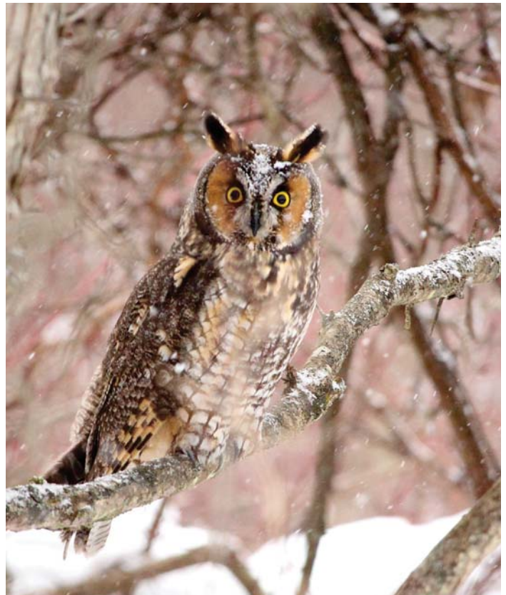
Long-eared Owl.