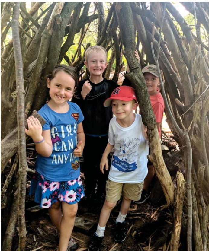
Day camp is a wonderful way for children to explore and learn about nature.

So much happens during the summer months that Audubon has to add staff members. To help with educational programming through the spring and summer, Audubon hires Nature Education Interns. Invasive species are still a concern on the grounds so Audubon will also hire Invasive Species personnel to help combat the high-priority invasives. Check the website auduboncnc.org/jobs for details and position openings beginning January 1, 2020.