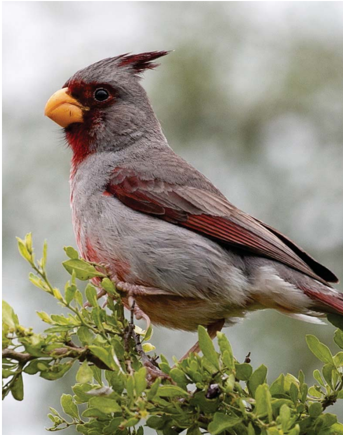
Detail of 2019 Field Guide Worthy category winner Zachary Gray's photograph, Pyrrhuloxia .