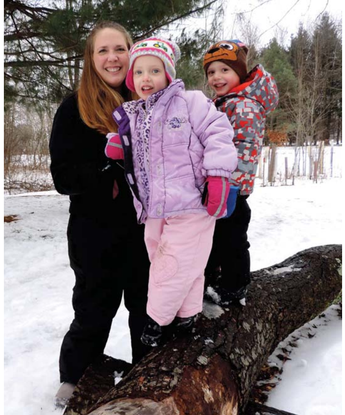
A family enjoying time together in the Nature Play Area on a winter afternoon.

In the meantime, members can renew as early as six months before their expiration date to take advantage of the current pricing structure. As always, ACNC is grateful for its members and the support that they provide the organization. Thank you!