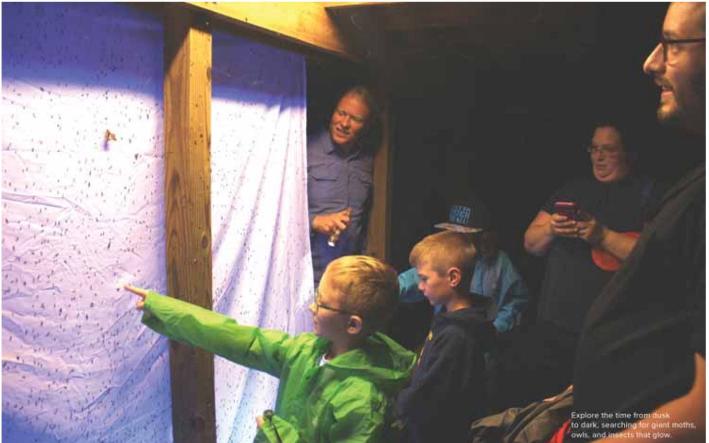
Explore the time from dusk to dark, searching for giant moths, owls, and insects that glow.