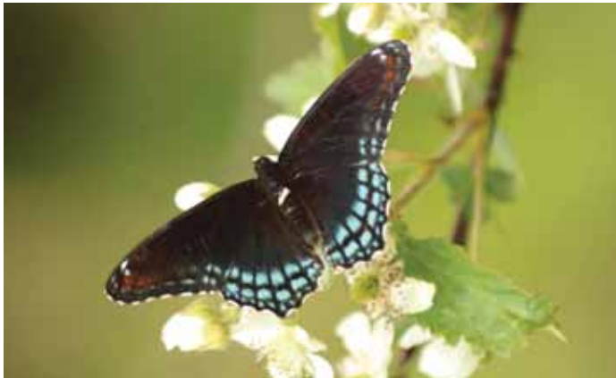
Red-spotted Purple, by Jeff Tome