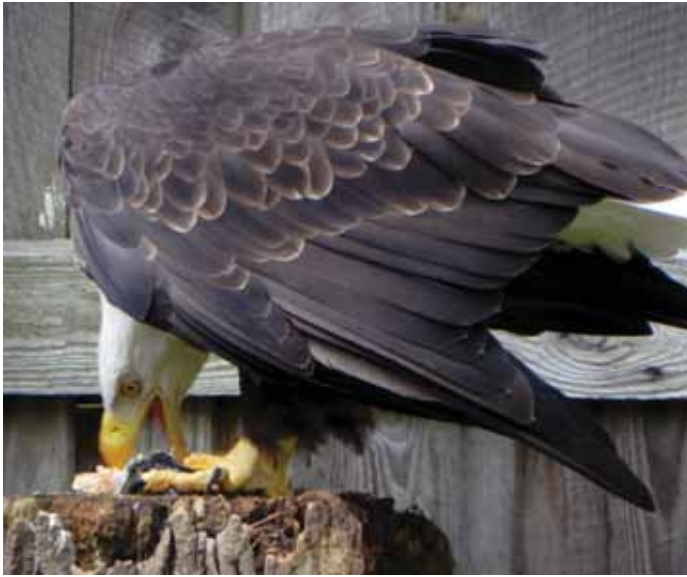
Liberty the Bald Eagle eating a fish.