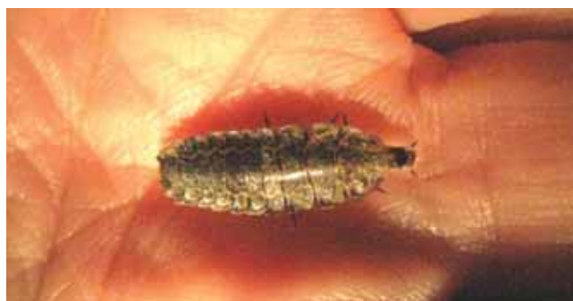
Adult Firefly Firefly larvae

Firefly larvae tend to be in damp areas and active in late spring and early fall. They also glow but for a different reason. Their steady glow is a warning to predators of their toxicity.