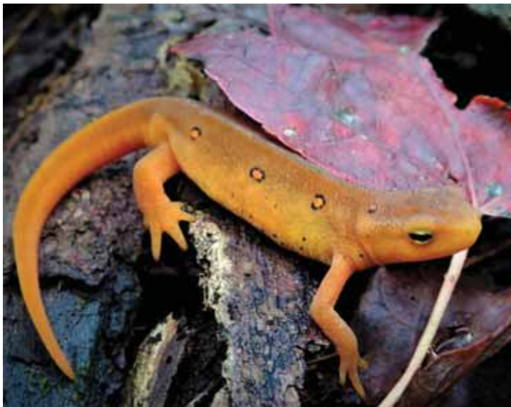
Red Eft

Her roots are in Harvey's Lake, Pennsylvania in the Wilkes-Barre/Scranton region. When she visits her extended family there, a great deal of time is spent adventuring with her young nieces and nephews.