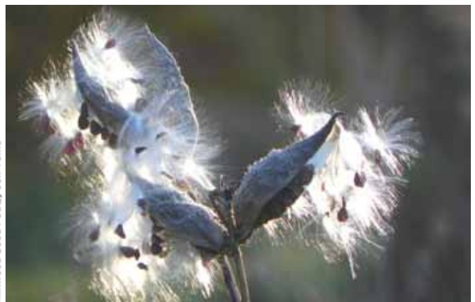
Milkweed Seed Pod

My spirit in this happy air Can thus embrace the dying year, And with it wrap me in a shroud As bright and clear!