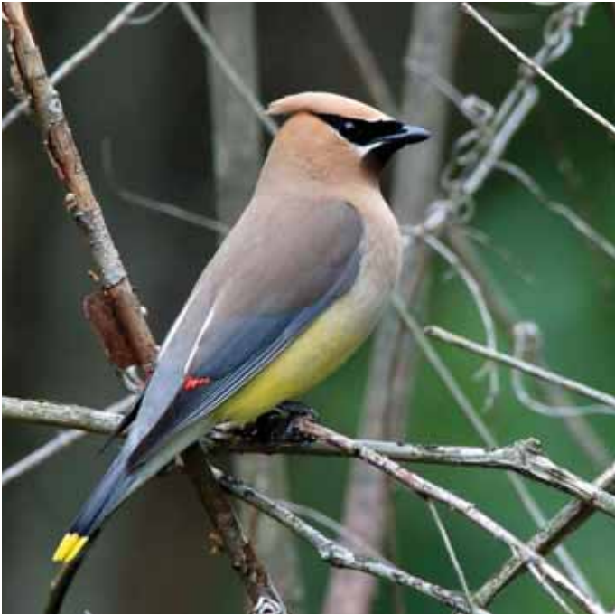
Cedar Waxwing