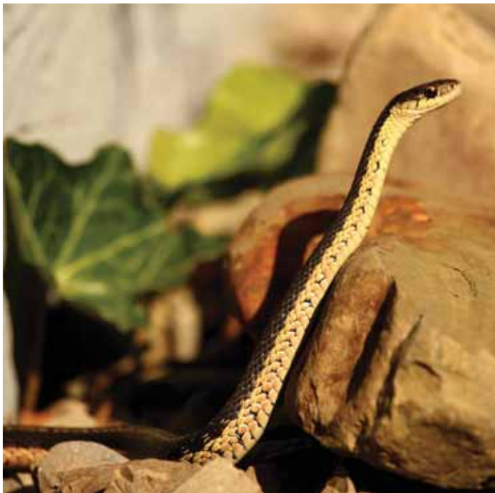
Garter Snake