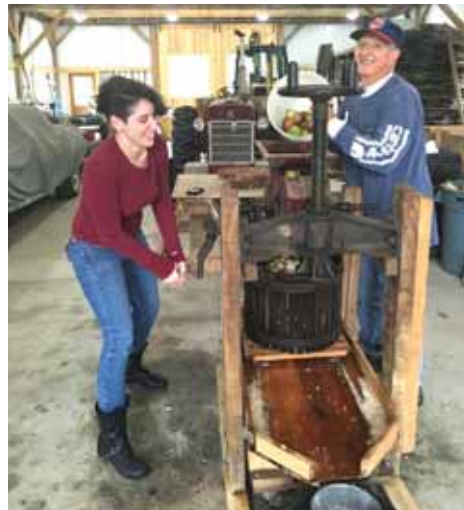
Pressing apples to make cider

Special Information: BYO brown bag lunch and conversation follows the program. Audubon provides coffee and tea.