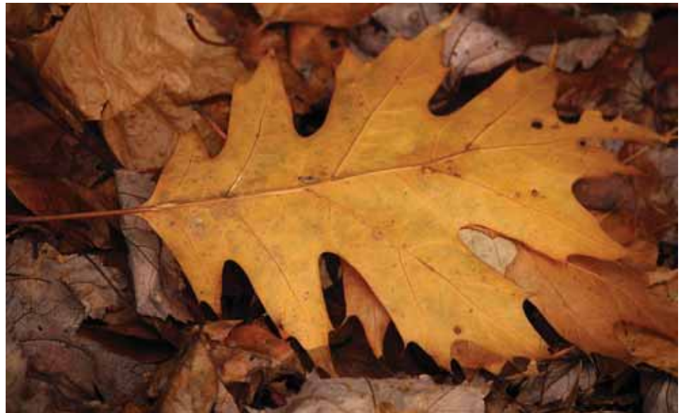
Red Oak Leaf