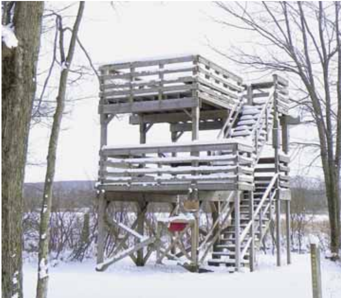
Hugh Wood Tower