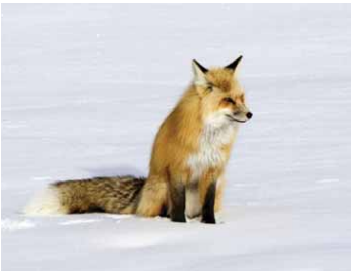
Red Fox