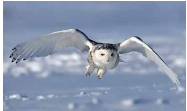
Snowy Owl, by Bert de Tilly