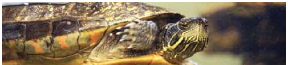
Tina the Painted Turtle

Special Information: Rain, snow, or shine. In the case of severe weather, the program will be cancelled.