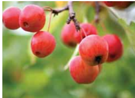
Crab Apples by Jennifer Schlick

Apple trees are hardy plants, but benefit from best placement in your landscape. Learn apple tree preferences in regards to pH, soil nutrients, soil types, drainage, and sun. Different varieties have different tolerances and you will learn about ones that may be more suitable to the land you already have. Choosing varieties that thrive in your existing conditions sets you up for early success.