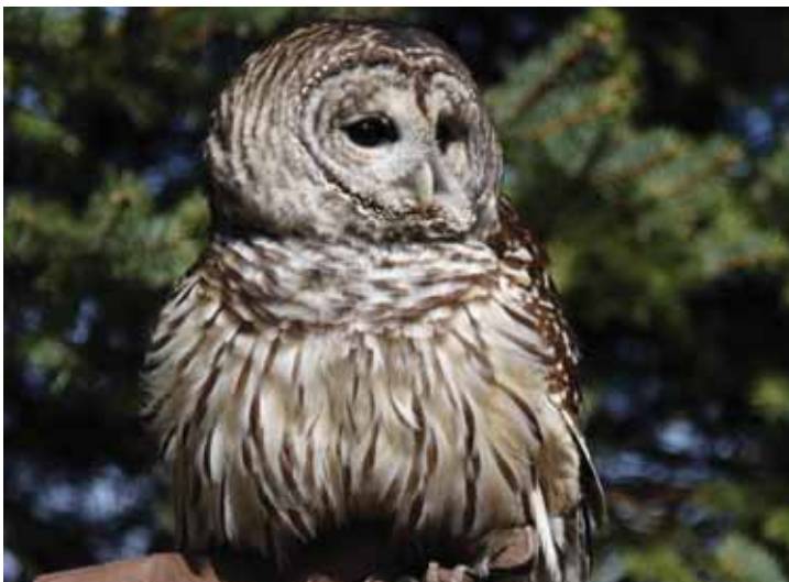
Barred Owl.