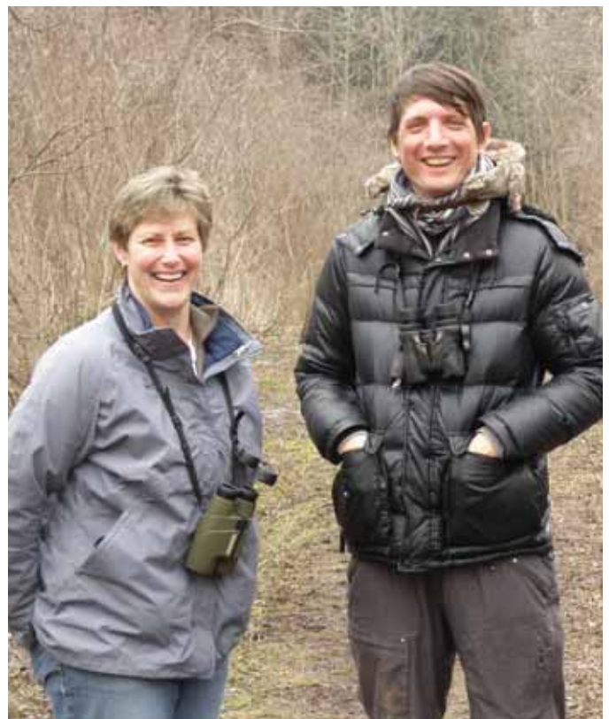
Christmas Bird Count participants help researchers gain more accurate information on birds.

Special Information: Dress for the weather, bring binoculars and a field guide if you have one. A thermos of hot chocolate isn't a bad idea.