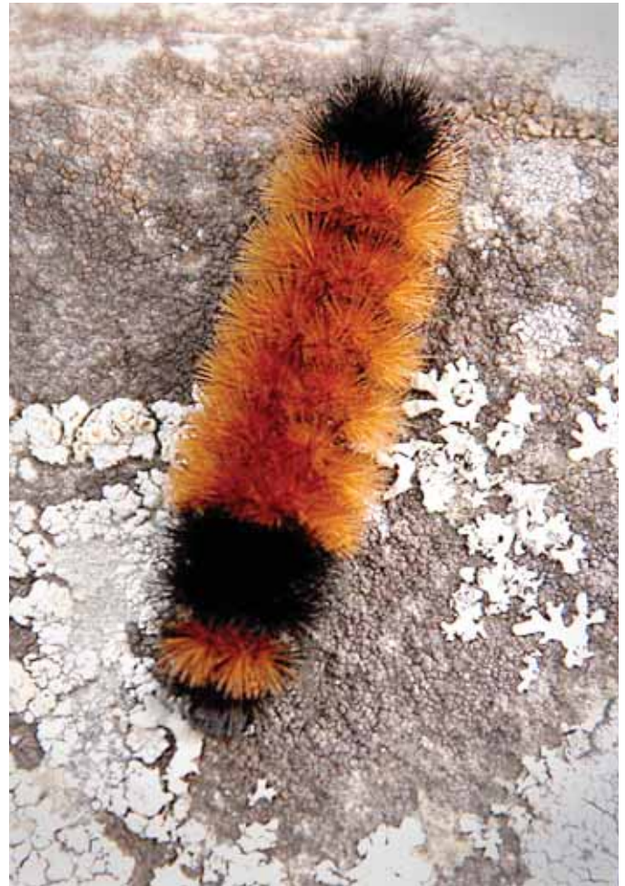
Woolley Bear. By Sheila Sund

Woolly Bear color patterns are perfect at telling when last winter ended. Then again, hindsight is 20/20. Almost anyone can say when last year's winter ended.