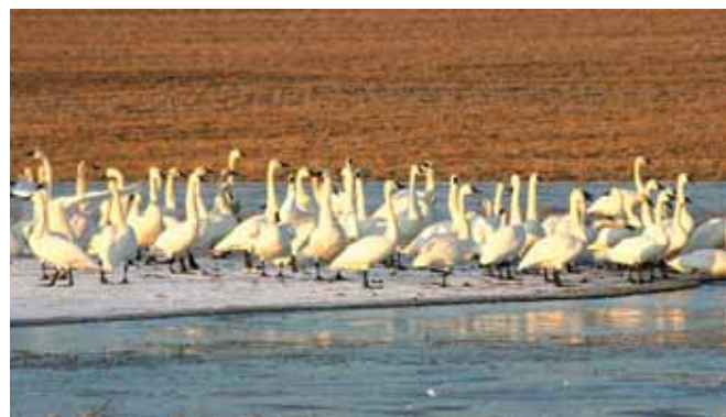
Top: Horned Grebes dive underwater for fish as they migrate. Bottom: Tundra Swans fly through the area each November.

Take some time to stare at a pond, lake or sky this fall and see if there are any migrating birds moving through your part of the world.