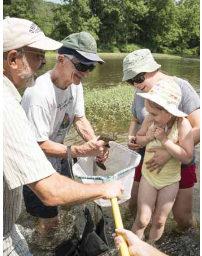
Participants of the Hellbender Survey exclusive earlier this year.