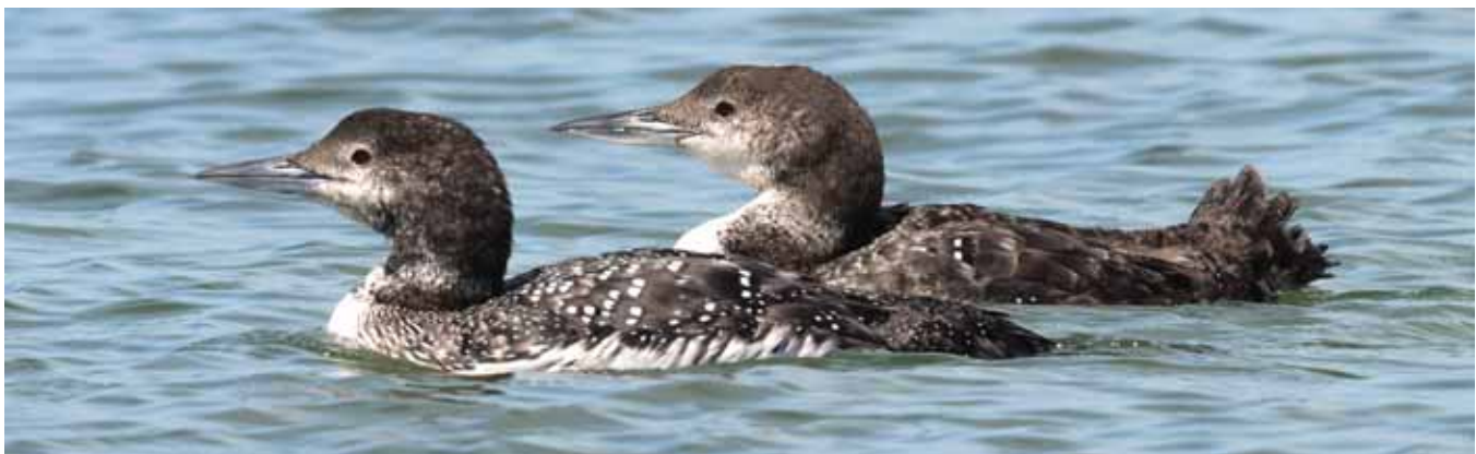
Loons migrate through the area and are often found on Chautauqua Lake in the Fall.

Take some time to stare at a pond, lake or sky this fall and see if there are any migrating birds moving through your part of the world.