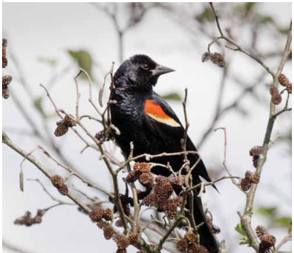
Red-winged Blackbird

Thank you, as always, for your support. We hope you enjoy this holiday season.