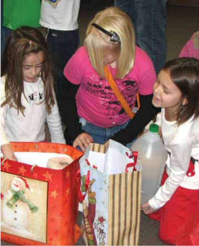
At Christmas with the Critters, open Giving Tree gifts, learn about animals, and make a craft.