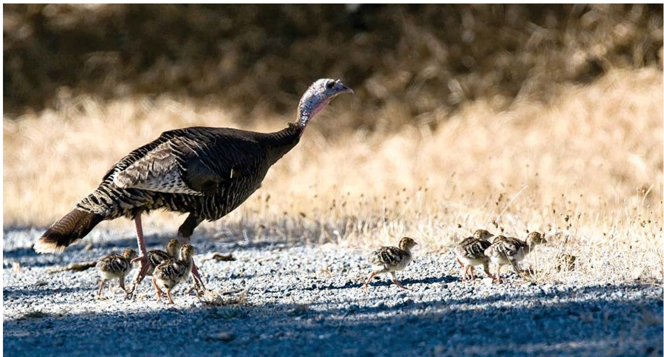
Top-Right: Male Wild Turkey strutting during spring mating season.; Bottom: Female Wild Turkey with juveniles.