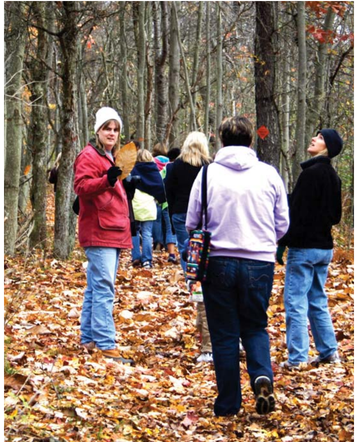
Audubon is a wonderful place for friends and family to share experiences in nature.

To participate in the exhibit, please stop by the Nature Center starting November 5, 2019.