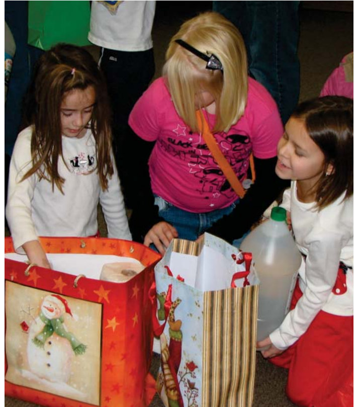
Children opening gifts from the Giving Tree during the Christmas with the Critters program.