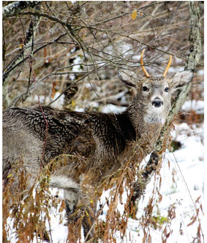
Young White-tailed Deer Buck.