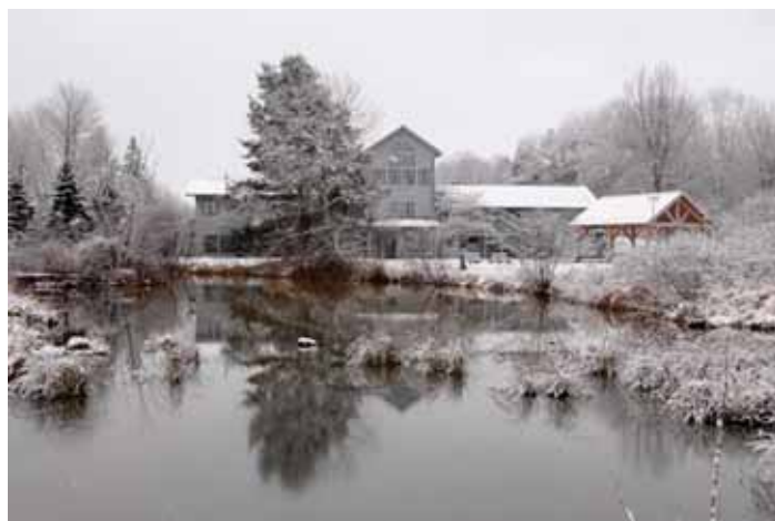
Help ACNC continue to grow by purchasing books in the Blue Heron Gift Shop or at bookshop.org .

Shop from ACNC's Bookshop page at bookshop.org/shop/auduboncommunitynaturecenter and 10% of your purchase will be donated to Audubon.