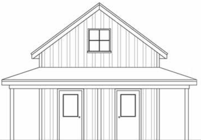
Structural plans for the care room that will be surrounded by enclosures. By Rock Hill Engineering LLC.

For more information on the 21 Day (Week) Challenge, please visit: americanbar.org/groups/labor_law/membership/equal_opportunity