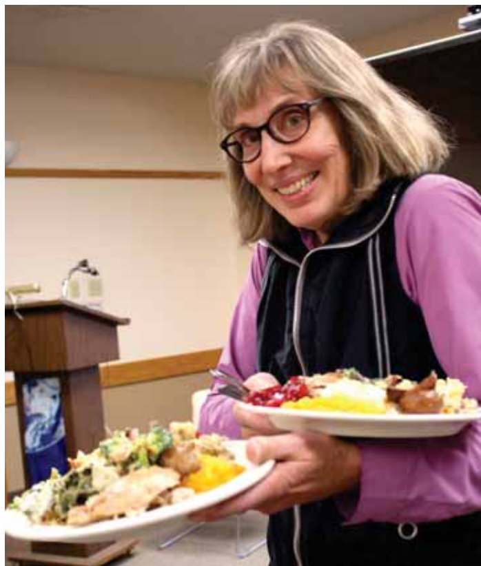
Submit your favorite recipes for the chance to share them in an Audubon Heritage Cookbook.