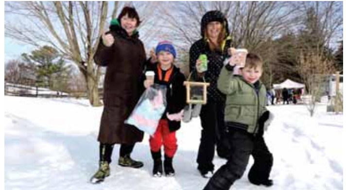
Audubon is a wonderful place for friends and family to share experiences in nature.

Now, more than ever, your membership is essential to Audubon Community Nature Center's existence. By being a Nature Center member, you get access to programs, discounts, early-bird registration, and exclusive events at a place that you have grown to love. Additionally, your membership provides necessary financial support that goes directly towards making the programs, people, animal care, and grounds upkeep possible. Through your membership, you show a commitment to ACNC's vision in which every child within the local community has a real and healthy connection to nature.