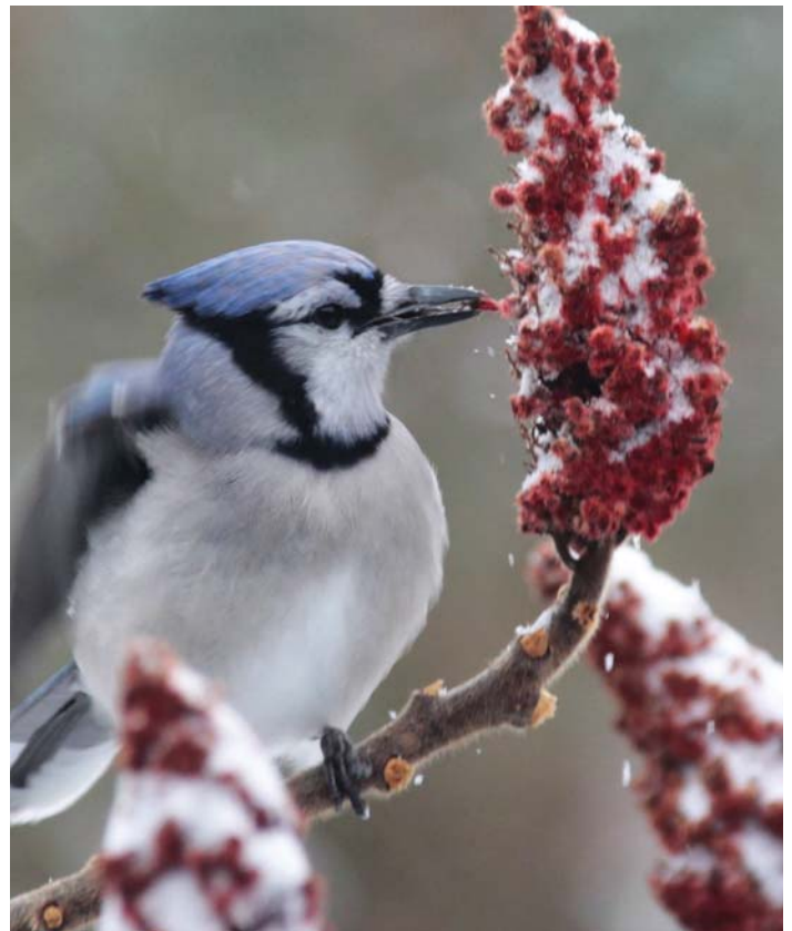
Blue Jay eating Sumac.