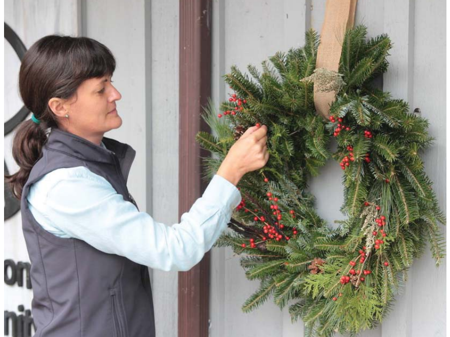
The “uniquely Audubon” wreath design changes each year, depending on what natural supplies are available for harvest.

Call the Nature Center at (716) 569-2345 or order online.