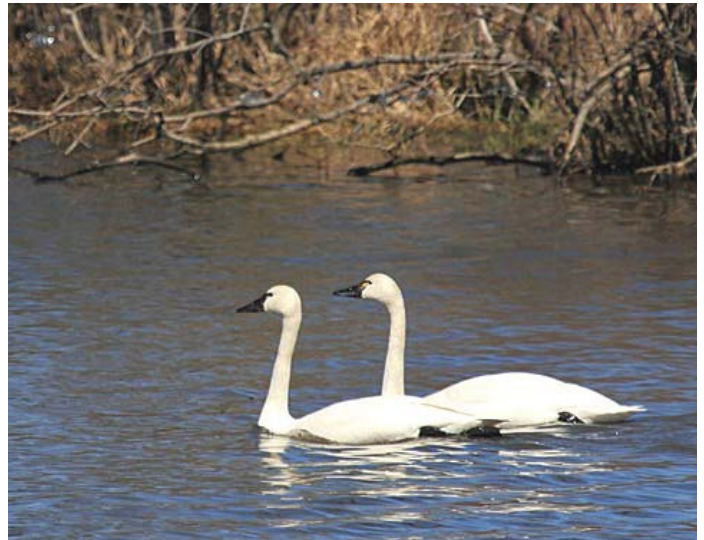
Tundra Swans on Big Pond.

Listen for the low, mournful hoots of the Tundra Swan on Big Pond in mid-November.