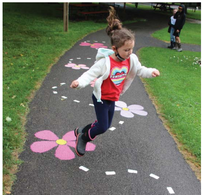
Visitors can play along the interactive nature art trail on their way to the Nature Play Area, thanks to a grant from the United Arts Appeal of Chautauqua County.

United Arts Appeal of Chautauqua County $296 — Interactive Nature Art Trail