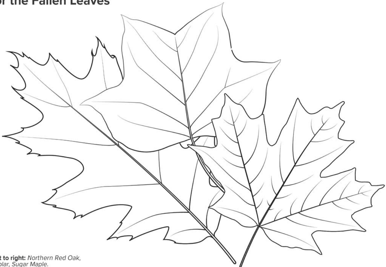
From left to right: Northern Red Oak, Tulip Poplar, Sugar Maple.