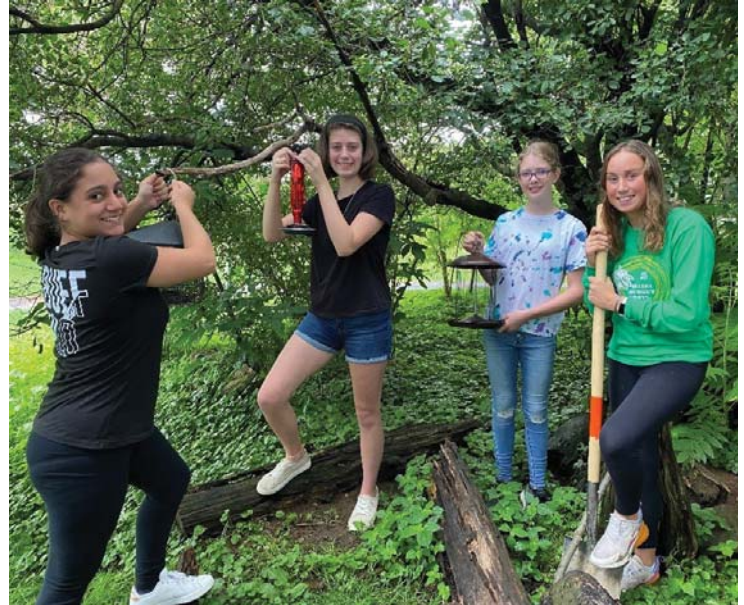
This summer, Audubon welcomed a crew of energetic teen volunteers to help at the Nature Center.