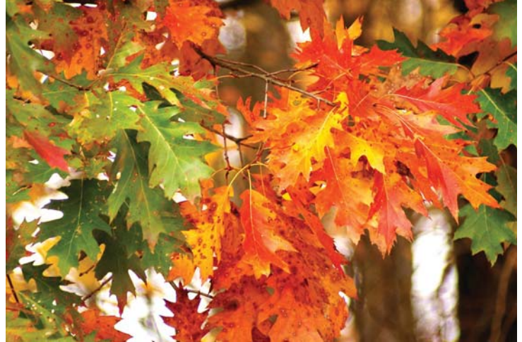
Autumn leaves.

When day length starts to decrease in the autumn, the leaves no longer have enough sunlight to continue producing chlorophyll. Without chlorophyll to make the leaves appear green, other pigments will be able to shine through. Two main types of carotenoids, carotenes and xanthophylls, contribute to the ranges of oranges and yellow. Chemical changes can also produce other anthocyanin, which show up as reds, pinks, and purples. The fall foliage also depends on weather and temperature, which is why the timing and exact color of leaves varies and provides a unique show every year.