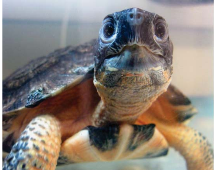
Ebenezer, the Wood Turtle, was overdue for a larger habitat space to call home. Audubon is grateful for the support and helpful hands that made this project a reality.

If you would like to support the live animals, please consider becoming an Animal Advocate. Stop by the reception desk, or visit auduboncnc.org/animaladvocates .