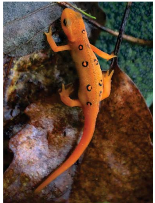
Eastern Newts spend two stages of life in the water before moving onto land. They migrate back as an adult to lay eggs. The land dwelling stage of their life is also referred to as a Red Eft. They're easily identified by their bright orange color and vibrant red-to-yellow spots circled in black on their back.