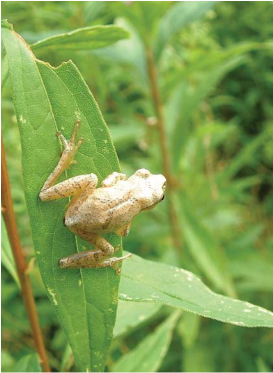
Spring peepers spend most of their adult lives in the woods.

Birds are not the only animals migrating in the spring. Amphibians emerge from their winter hiding spots and get ready to mate and lay eggs each year in the spring. Since they lay their eggs in water, forest-dwelling amphibians such as Spotted Salamanders, Wood Frogs, and Spring Peepers must migrate from their forest homes to a pond or vernal pool.