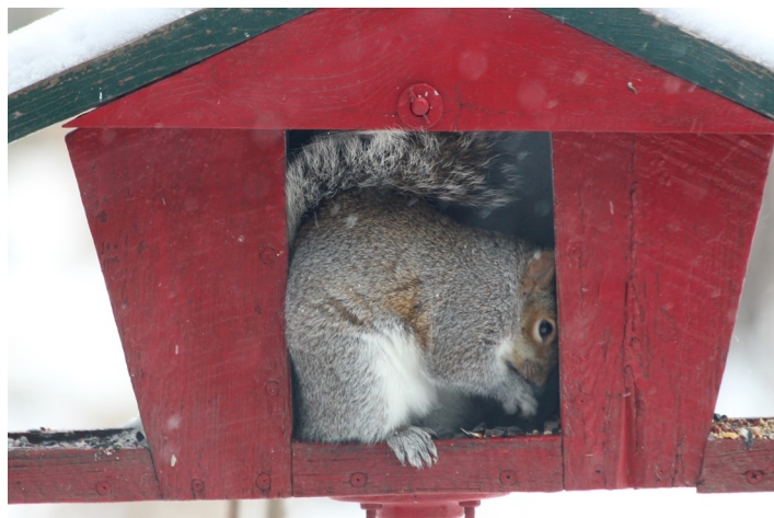
Left Top: Red Squirrel eating a mushroom. Left Bottom: Squirrels find food wherever they can, including bird feeders. Right: Chipmunk with cheeks full.