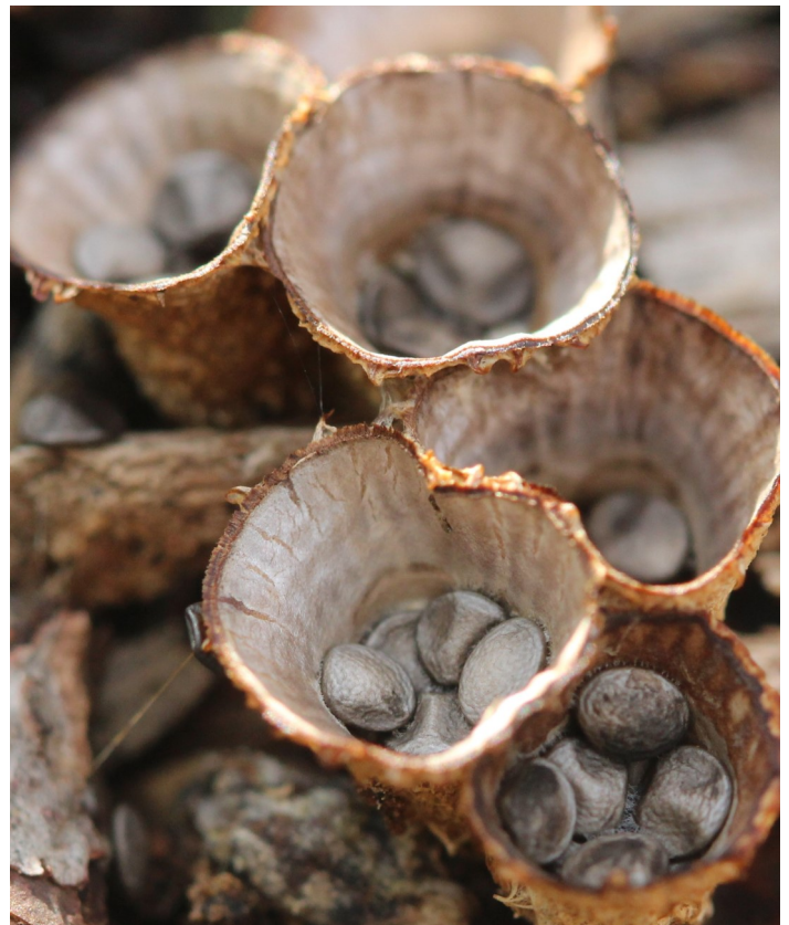
Bird's Nest Fungus.