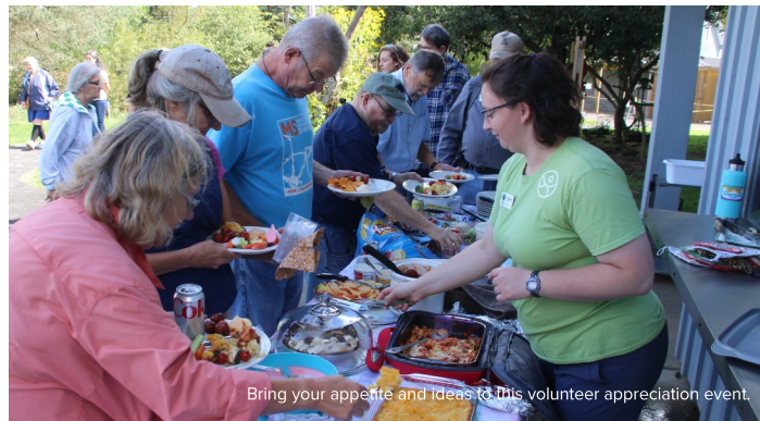
Bring your appetite and ideas to this volunteer appreciation event.