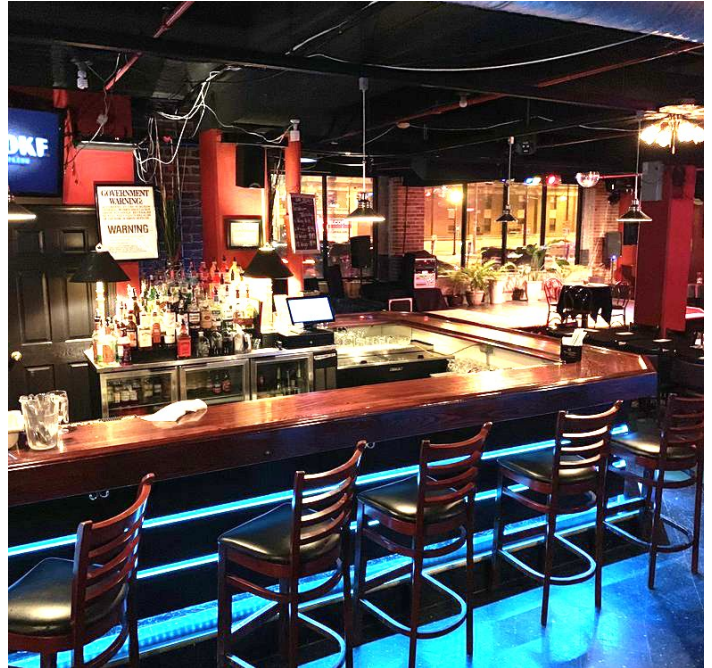
Gather your friends for a night out to support ACNC.

More information on Shawbucks can be found at shawbucks.com . To learn more about this fundraiser, visit auduboncnc.org or call (716) 569-2345