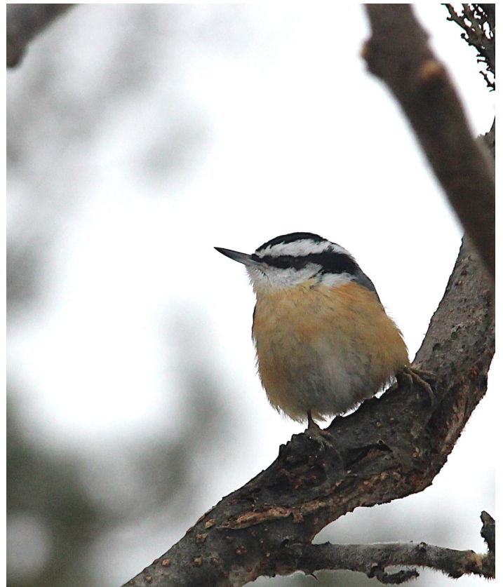
Red-breasted Nuthatch.