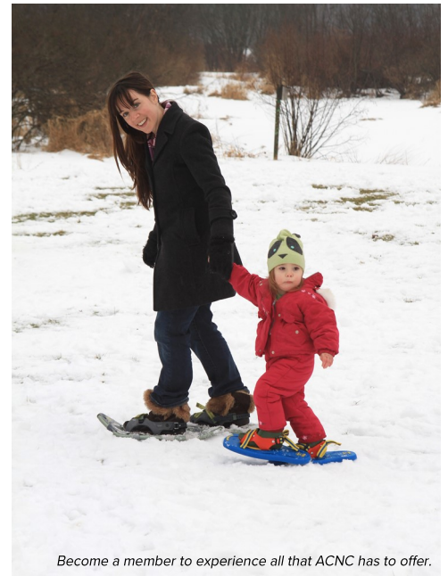
Become a member to experience all that ACNC has to offer.