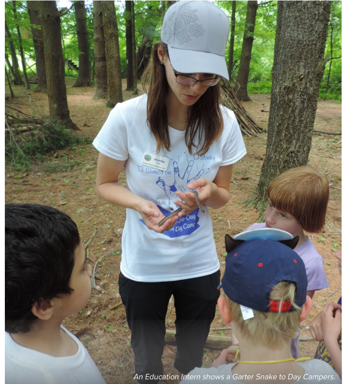
An Education Intern shows a Garter Snake to Day Campers.

Paid internship applications are available at online auduboncnc.org/jobs .