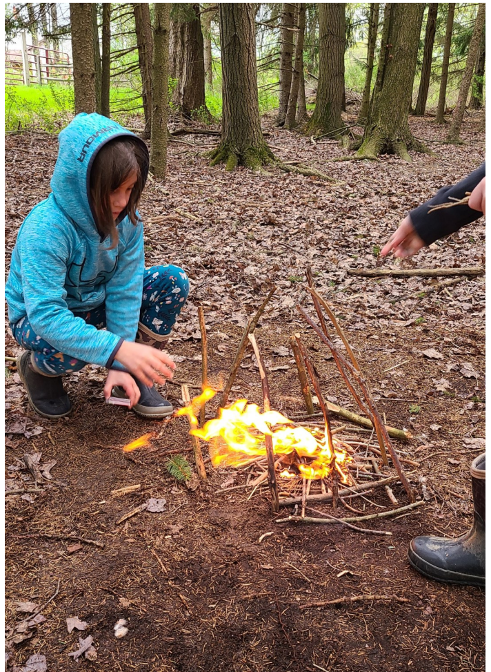
For February's program, children can learn how to responsibly build and maintain a fire.

The program is designed to provide both content and hands-on experiences, as studies show that children learn better by doing and when given information in multiple methods. Classes include an outdoor component, and the topics are designed so that the accompanying adult can build on and reinforce the information and activity after the program.