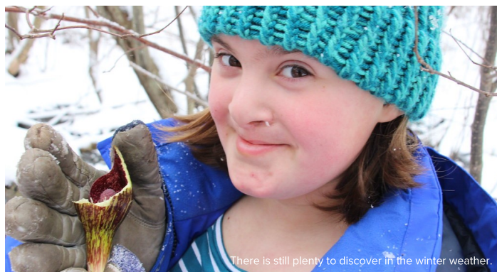
There is still plenty to discover in the winter weather.