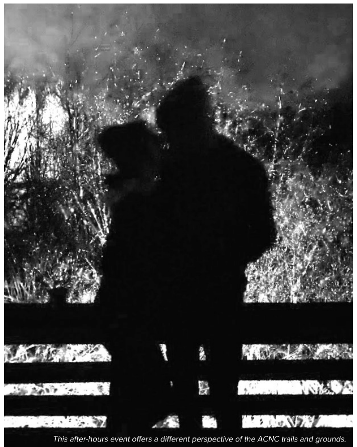
This after-hours event offers a different perspective of the ACNC trails and grounds.

Purchase small LED lights at the entrance for additional fun, as well as glasses that refract the light to make the trail even more amazing! Bring cash to make purchasing easier.