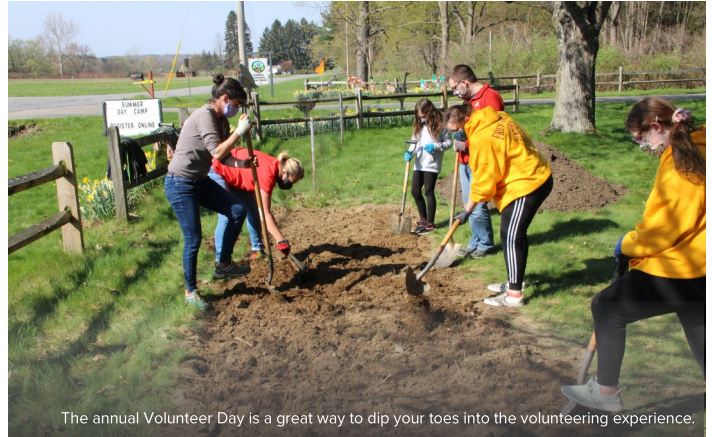
The annual Volunteer Day is a great way to dip your toes into the volunteering experience.