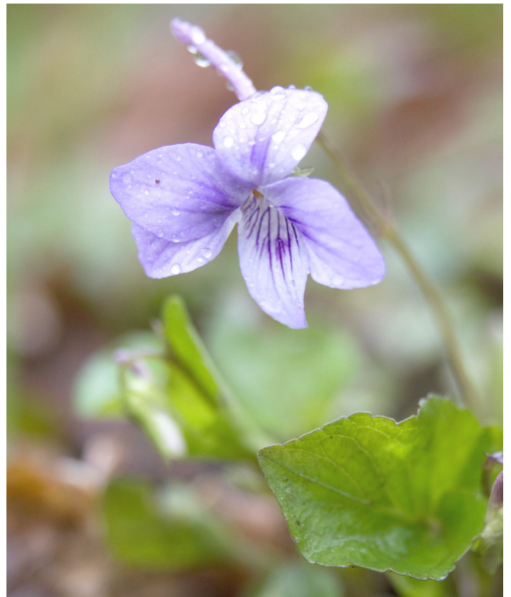
Long-Spurred Violet.