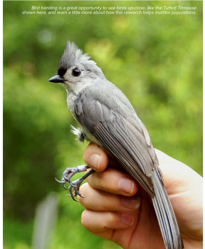
Bird banding is a great opportunity to see birds up-close, like the Tufted Titmouse shown here, and learn a little more about how this research helps monitor populations.

You can watch the bird banding process and see birds up close at Audubon by the Urban Pavilion on April 29, May 6, May 13, and May 20. There will be further dates in the summer.