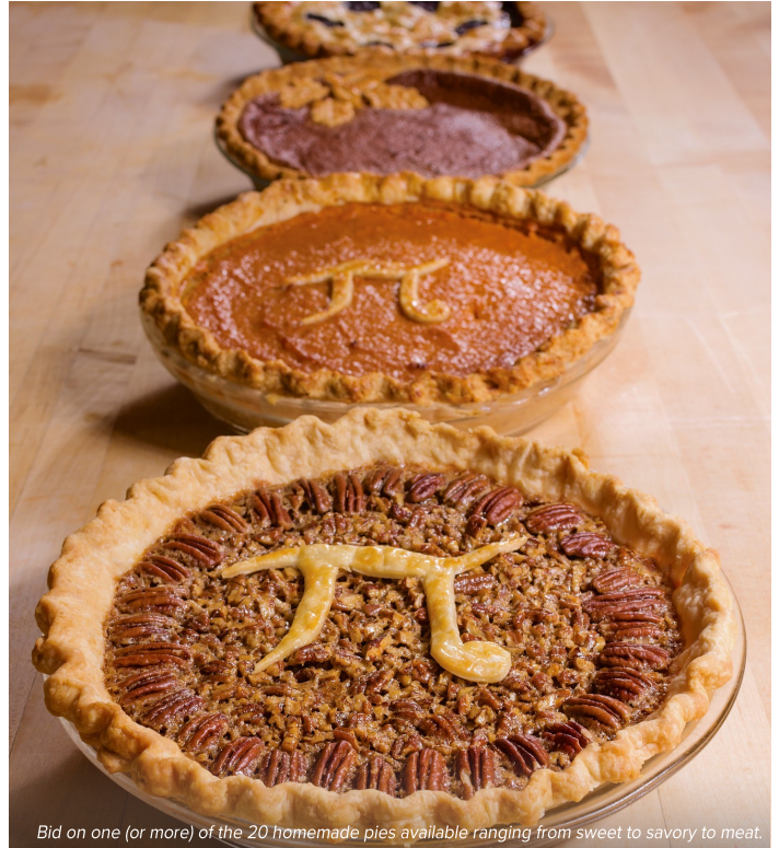
Bid on one (or more) of the 20 homemade pies available ranging from sweet to savory to meat.

100% of the proceeds from this auction support Audubon's staff, buildings, and grounds so the community has a safe space to get outside and enjoy the benefits of nature. The auction begins at 5:00 a.m. on March 3 and ends at 9:00 p.m. on March 8 at 32auctions.com/ACNC23 . Winners can pick up their pies from noon – 4:30 p.m. on March 11.