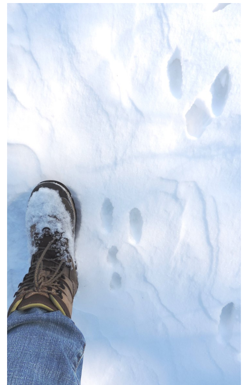
Top Right: Eastern Cottontail.