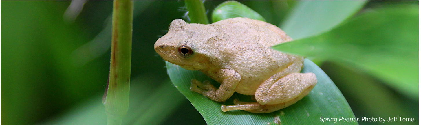
Spring Peeper.