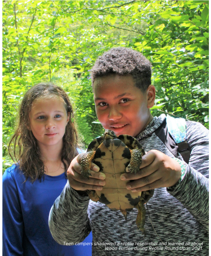
Teen campers shadowed a reptile researcher and learned all about Wood Turtles during Reptile Round-Up in 2021.

There are scholarships, camperships, and volunteer opportunities available as well. Make Audubon a part of your child's summer this year. Full camps are noted on the registration page, though some open second sessions if the waitlist and staffing permits.