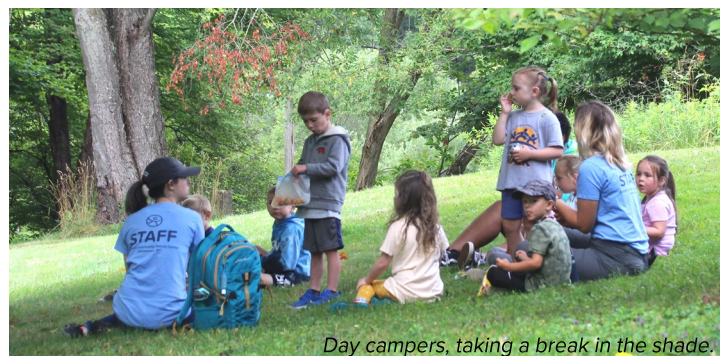
Day campers, taking a break in the shade.