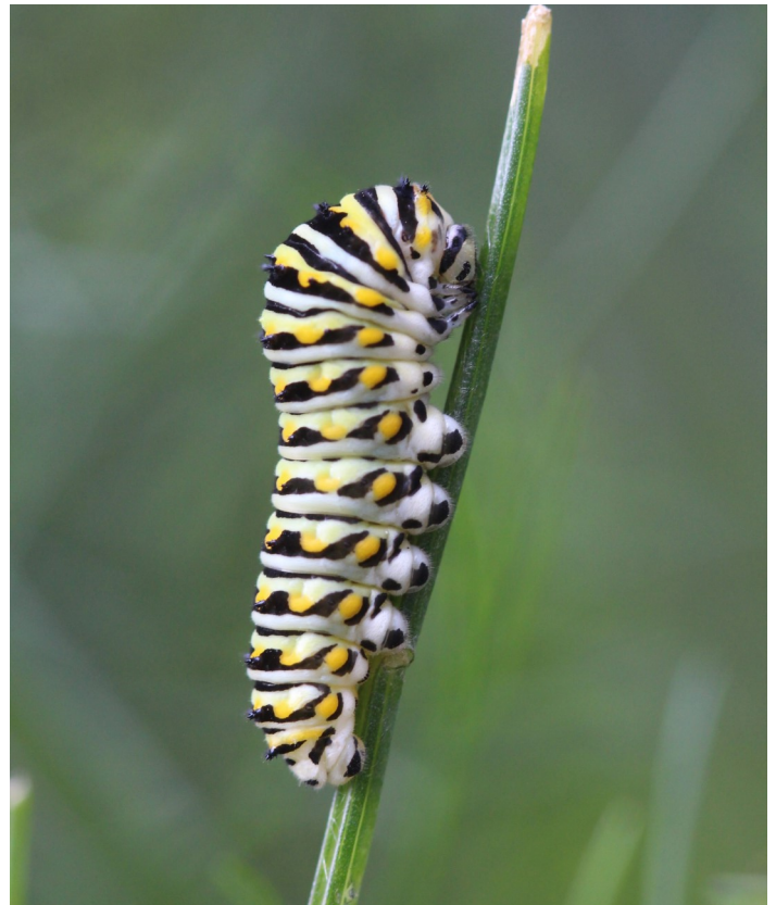
Black Swallowtail Caterpillar.