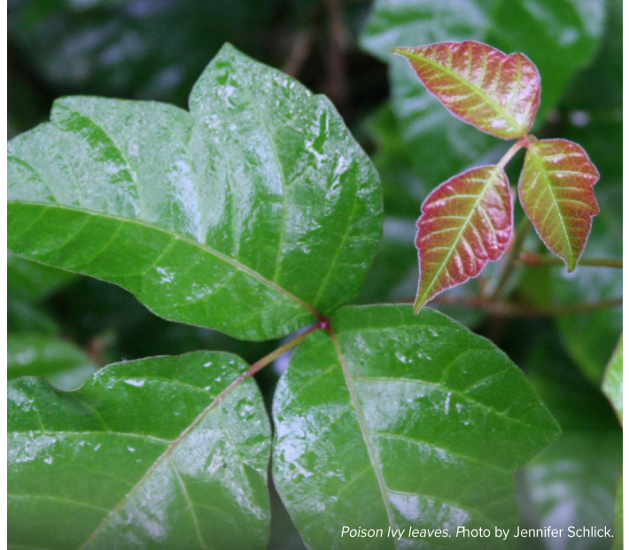
Poison Ivy leaves.

Wear long pants and closed-toed shoes to help keep the urushiol off the skin, but remember to wash your clothes when you get home. If you do come into