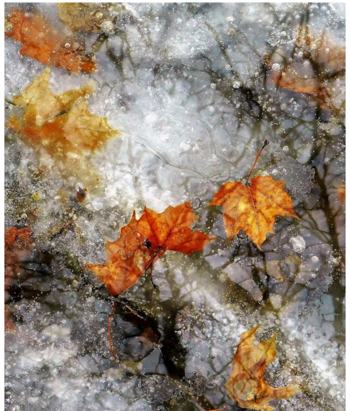
Fall into Winter.