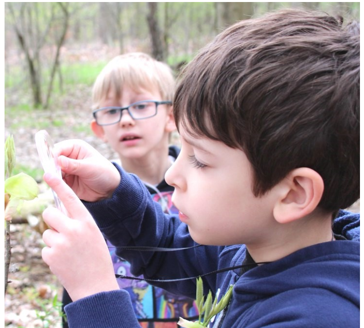
Donations support ACNC's mission to connect children to nature.