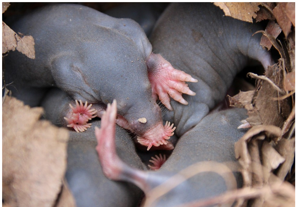
Top Right: Star-nosed Mole nose.