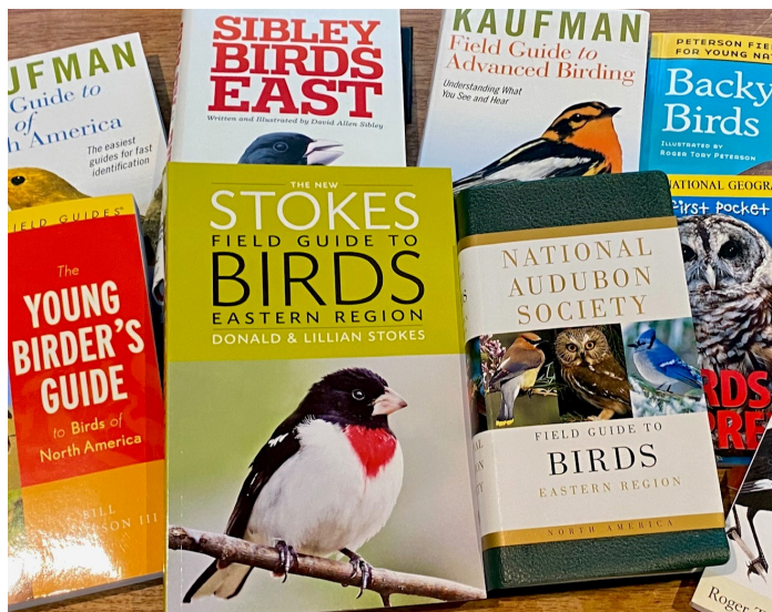
Find your field guide preference at the Blue Heron Gift Shop.

The gift shop also carried guides for insects, reptiles, mammals, trees, wildflowers, and more.