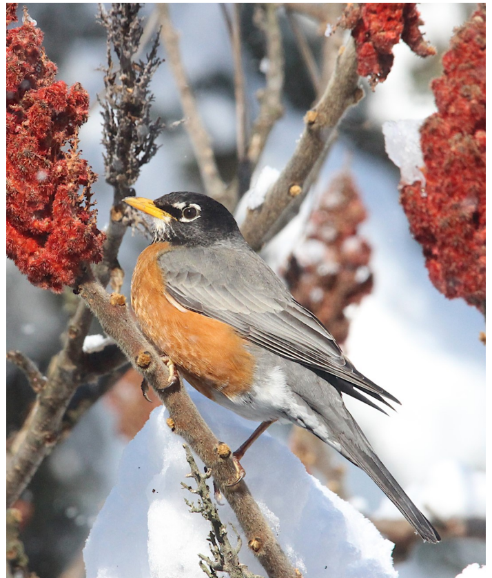
American Robin on Staghorn Sumac.