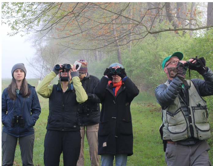
Staff and volunteers flocked together to create birding teams in the 2023 birdathon.

Help ACNC by forming a team, or by donating to support local birders.