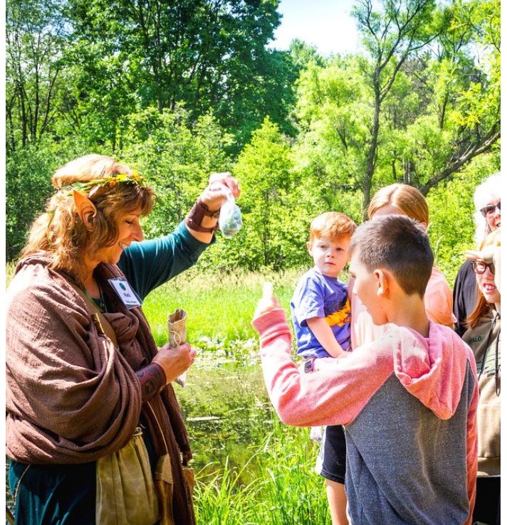
Each year offers new magical surprises on the trails.

The Dragons and Fairies Festival transforms the grounds of Audubon into a delightful mix of all things magical. Visitors can try their hand at archery, make a wizard staff, search for unicorns, take a horse-drawn wagon ride, jump into a drum circle, make a wish on the wishing tree, hunt for garden gnomes, and so much more. Adults and children alike are encouraged to wear their favorite costumes. Sixpence, a local band with Celtic roots, will play live music.