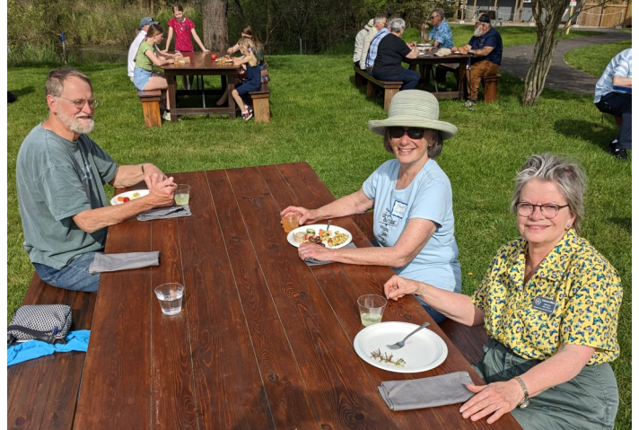
The volunteer recognition picnic is a great chance for volunteers to meet other like minded folks from different areas of the organization.

Interested in volunteering? Please contact Emily Nelson at: enelson@auduboncnc.org or (716) 569-2345 x103