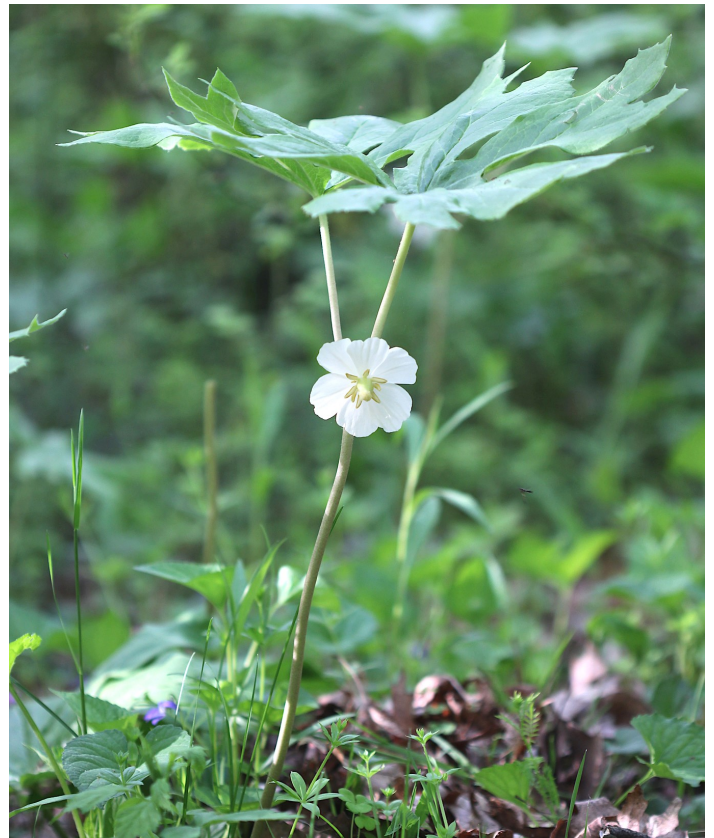
Mayapple in bloom.