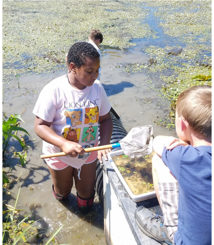
Pond dipping is a Day Camp favorite where campers get an up-close encounter with all of the pond life that often goes unnoticed.

Registration and applications are open online at: auduboncnc.org/daycamp