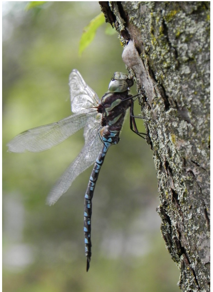
One of the darner dragonflies.

It's easy to be enthralled by the dragonflies, with their jewel-like colors and dazzling performances. There are many fierce hunters in the world around us, but few hunt with the grace and beauty of the dragonfly.