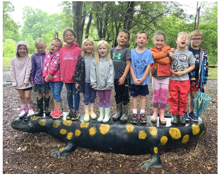
Donations support ACNC's mission to connect children to nature.