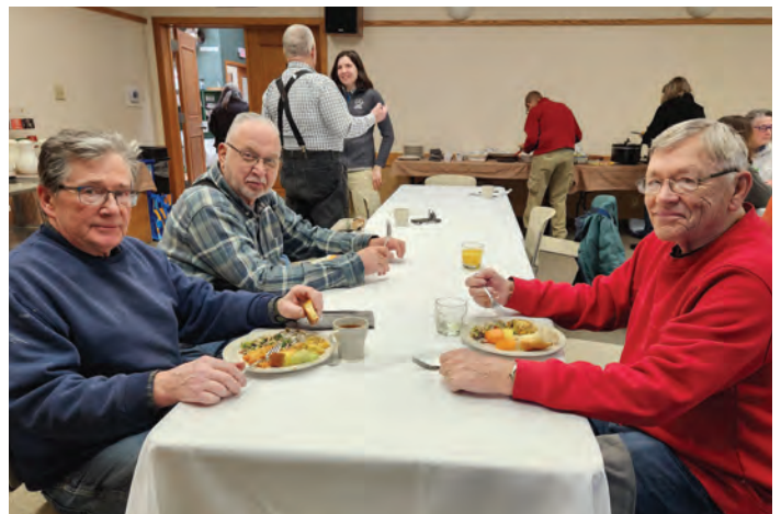
Volunteers were honored during Audubon's recent Volunteer Luncheon.

Audubon Community Nature Center's Board of Directors, Chairs, and Committee Members are volunteers.