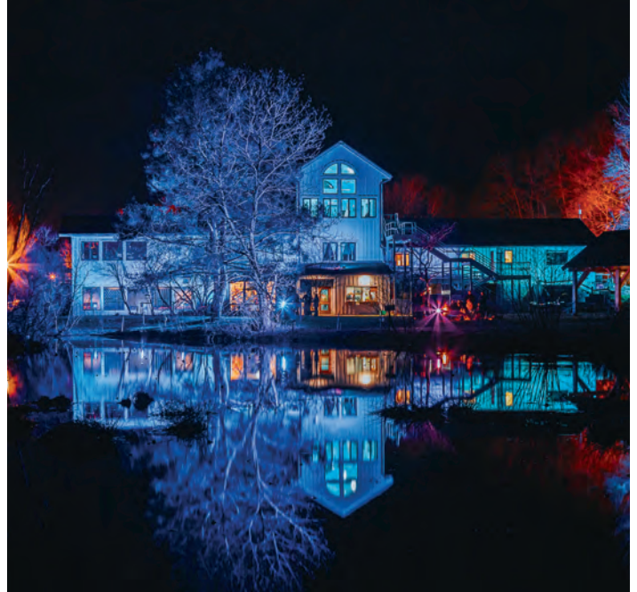
Enjoy a luminary-lit trail of lights at Audubon Lights on weekends from March 21 through April 5.

The trail ends at the Nature Center with a warm fire, hot drinks, popcorn, and other snacks for sale, as well as live entertainment. The Nature Center building and exhibits will be open to explore during the event.