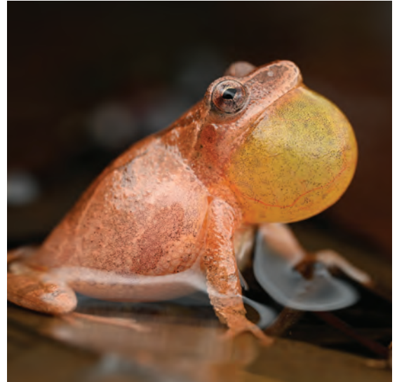
Male Spring Peepers inflate their throats when calling.

Outside of this breeding season, Spring Peepers are more often found in woody areas and shrubby grasslands. They are good climbers with sticky toe pads, but spend much of their time hiding under the leaf litter on the ground. As spring fades into summer, the Spring Peeper call also fades to give way to other frog and toad calls.