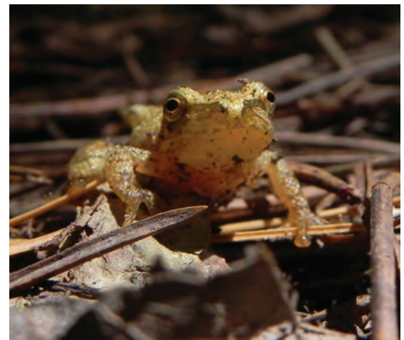
Spring Peeper on forest floor.