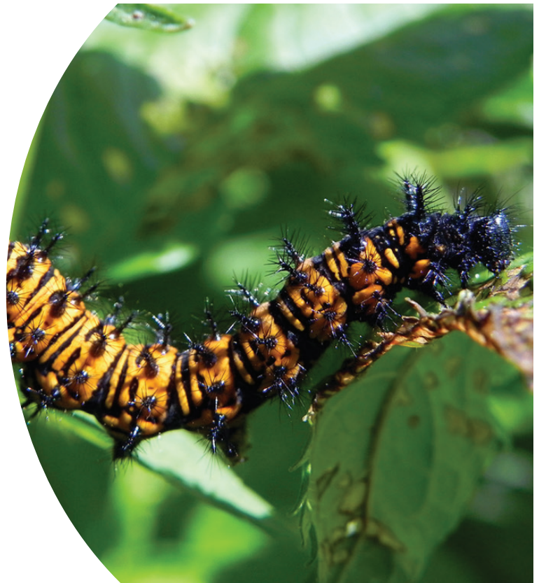
Baltimore Checkerspot Caterpillar