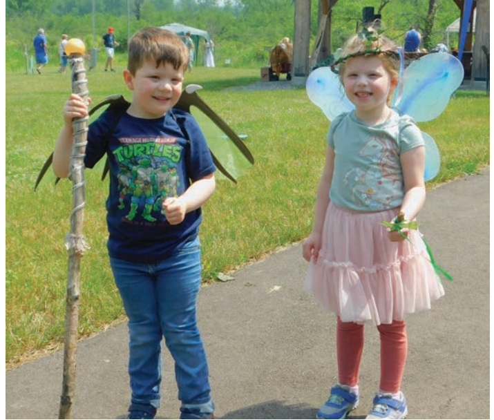
ACNC's June 21 Dragons and Fairies Festival has fun for kids, artisans at work, archery, live Celtic music, and more!

Register today at auduboncnc.org/events .