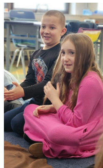
Donations support ACNC's mission to connect children to nature.