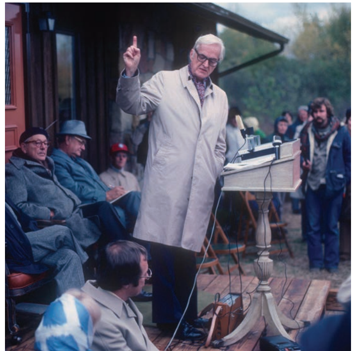
1976 dedication of the Roger Tory Peterson Nature Interpretive Building (the original name of ACNC).