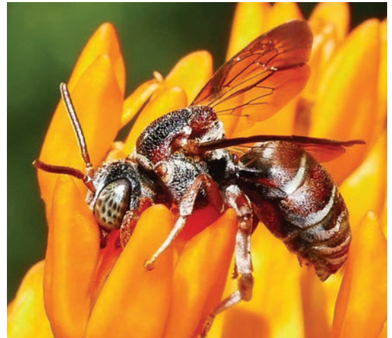
Cuckoo Bees have smooth bodies. They don't need hairy bodies like other bees have to collect pollen to feed their larva.