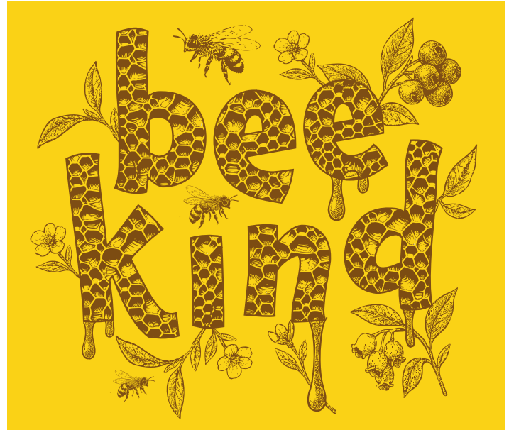
Bees are featured in two Audubon Community Nature Center exhibits for all ages to discover, learn, and explore.

Place your order at auduboncnc.org/bee-kind