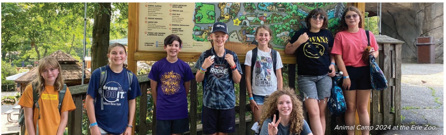
Animal Camp 2024 at the Erie Zoo.

Thank you to Audubon Community Nature Center’s Board of Directors, Chairs, and Committee Members to help ACNC run smoothly and effectively!