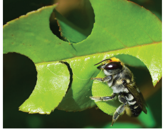
Leaf cutter bees line their nests with oval shaped pieces of leaves.

On warm summer days, take a close look at who's feeding on flowers, and you may notice the variety of bees.